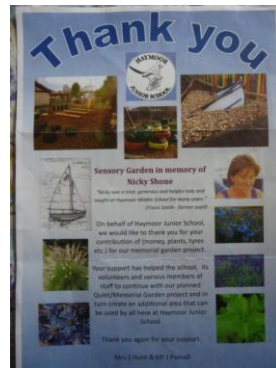
Haymoor Primary School CONGRATULATIONS!