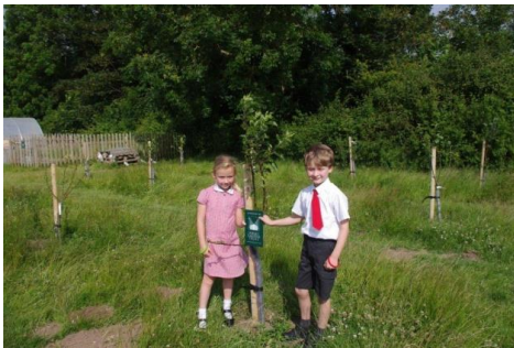
Radipole Primary School WELL DONE!

In this edition we would like to congratulate the following schools for successfully finishing their project: