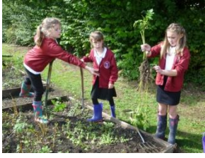
A successful harvest at Thornford Primary School

OUR PRIZE PHOTO THIS EDITION - showing us that even in the most unlikely situations you can start a garden – WELL DONE !