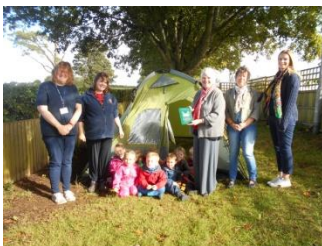
Little Gryphon's Nursery – Good luck with your garden!